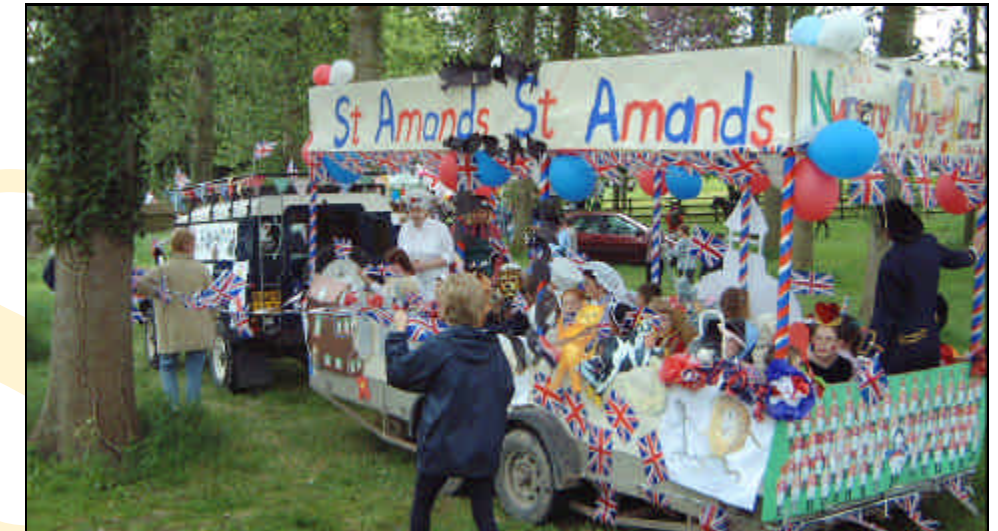
St Amands Float - runner up best childrens decorated float.