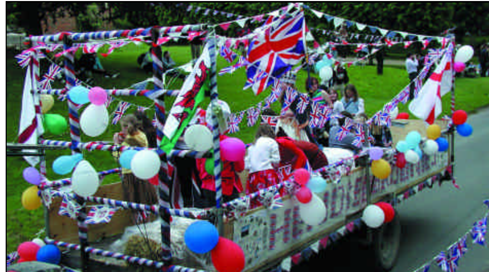
Brownies winning entry - best decorated children's float.