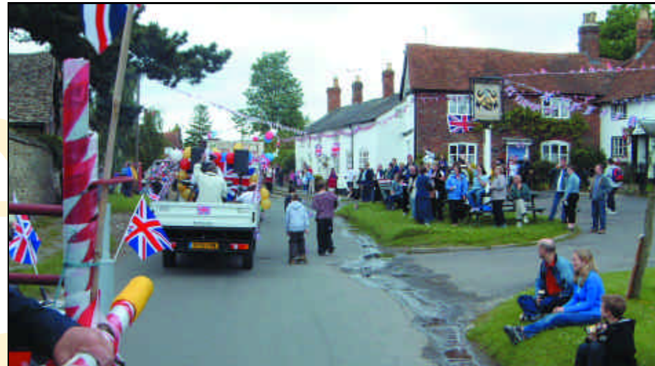
Jubilee floats travelling through the village.