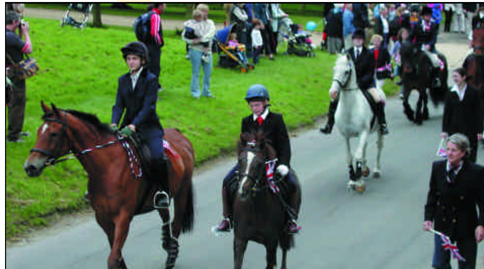
Horses leading the procession.