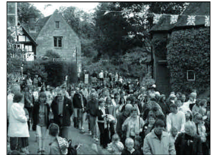
Huge crowds turned out to celebrate the Golden Jubilee in East Hendred.

Children's races followed at the Sports ground, then teas for the village children, and the presentation by the Parish Council of special commemorative mugs to children living in the village. There were bouncy castles and face painting for the children (all for free!) and plenty of food and drink for the adults. In the evening the carving of the pig started. Disco music was available all day for listening and for dancing to later in the evening. A Royal Knowledge quiz was organised. The finale was lighting the beacon on Runnington Hill by the chairmen of East & West Hendred Parish Councils, as part of a national chain, accompanied by fireworks. What a day to remember! The Parish Council who took overall responsibility for organising the day has received many letters thanking them for organising this special day which was obviously very much appreciated by the village. The overall comment was that this was one of the first recent events in the village that