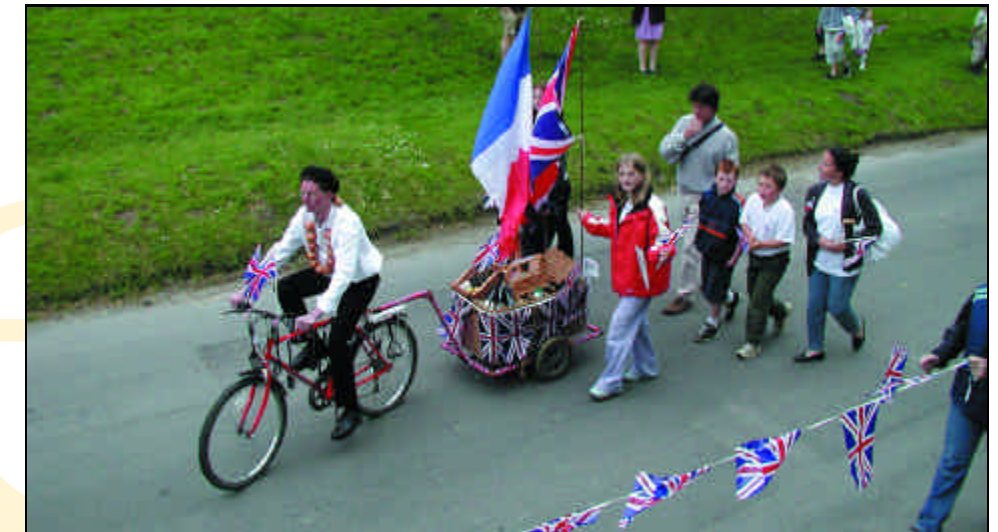
Twinning groups entry - runner up best adults decorated float.