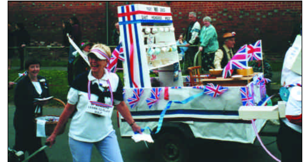
East and West Hendred WI - best adult decorated float.