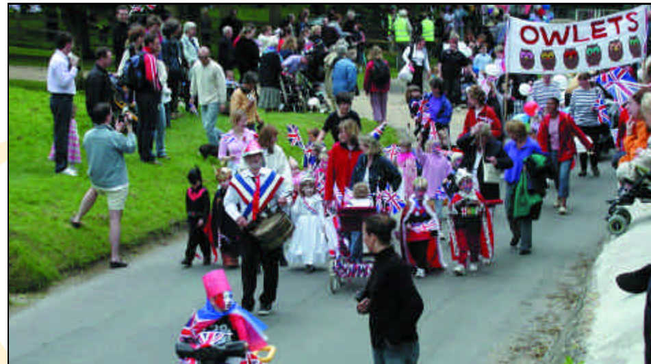
Pre-school and Owlets lead the procession.