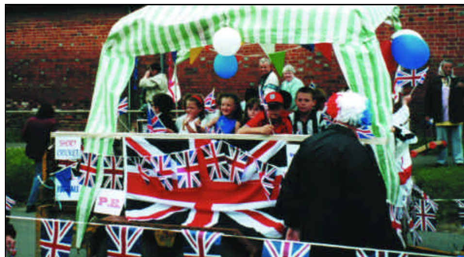
Hendred Primary School float.