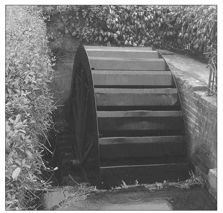
Ludbridge Mill - local water power

The Parish Council has been successful in obtaining a small grant from Thames Valley Energy (a new unit sponsored by the Countryside Agency as part of their Community Renewables Initiative ) to undertake a feasibility study of developing renewable energy sources for the village. The Government has set a national target of 10% of electricity to be generated from renewable sources by 2010, to help meet the requirements for overall reduction in greenhouse gases. Most of the village energy at present is generated from gas, electricity, with some wood burn-