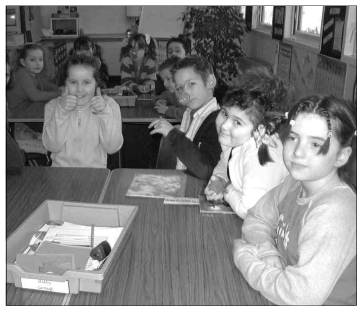
Pupils from Hendreds Primary School celebrate Red Nose Day

A cake and crafts stall was also held the following day at Wantage Leisure Centre