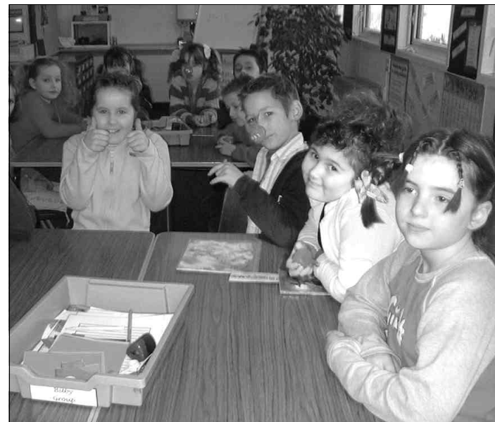
Pupils from Hendreds Primary School celebrate Red Nose Day

was popular with both pupils and teachers, most of them wearing their red noses for most of the day, as seen in the photo above. A cake and crafts stall was also held the following day at Wantage Leisure Centre