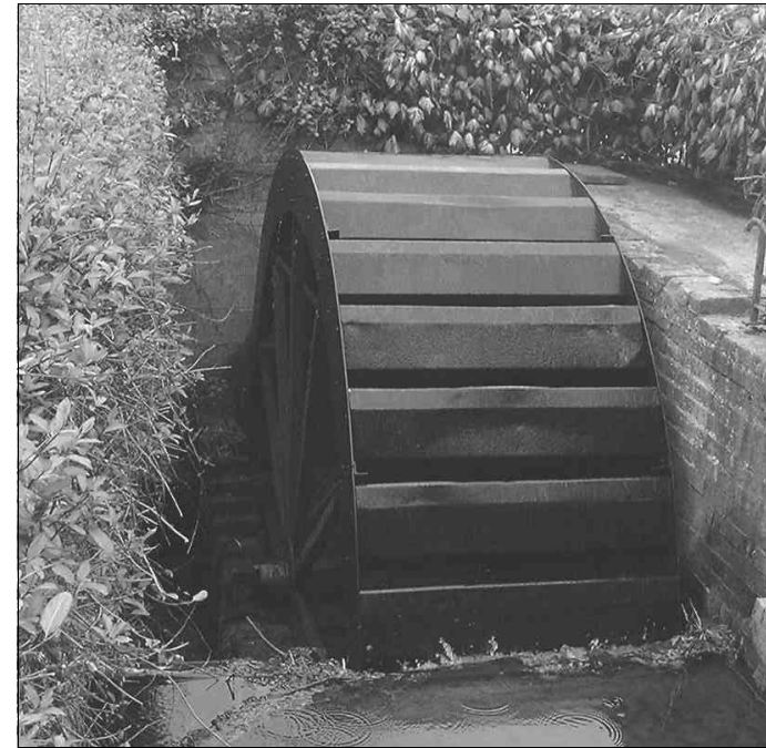
Ludbridge Mill - local water power

The Parish Council has been successful in obtaining a small grant from Thames Valley Energy (a new unit sponsored by the Countryside Agency as part of their Community Renewables Initiative) to undertake a feasibility study of developing renewable energy sources for the village. The Government has set a national target of 10% of electricity to be generated from renewable sources by 2010, to help meet the requirements for overall reduction in greenhouse gases. Most of the village energy at present is generated from gas, electricity, with some wood burn-