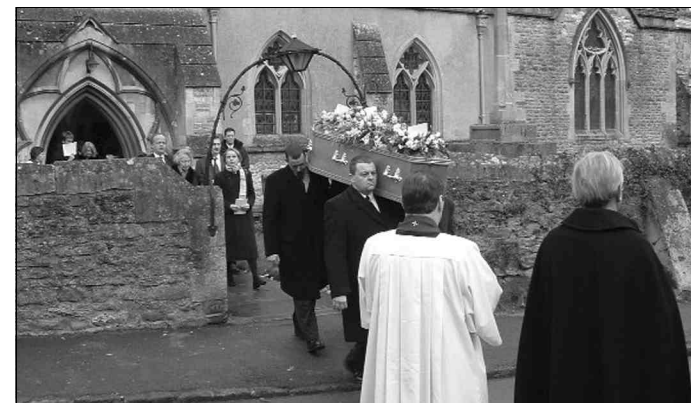
The funeral of Lord Jenkins, held at St Augustines church in January

Senior politician, President of the European Union, Chancellor of Oxford University, distinguished author, Vice President of the Hendreds Sports Club, long standing village resident.