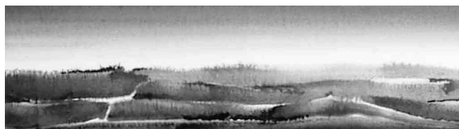
Shepherds Hill 2003

An exhibition of paintings at the Loyd Lindsay Rooms, Ardington