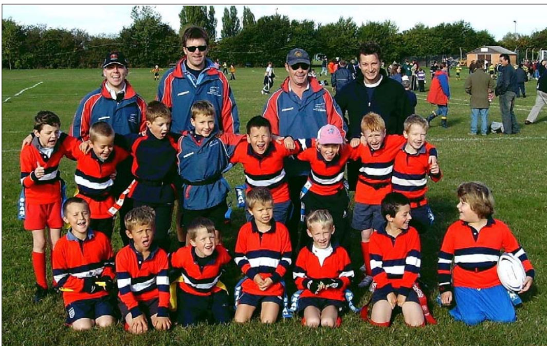
Photo: Under-8's squad, which is in its last season before "contact" Rugby starts next year.

For further details, see www.groverfc.co.uk .