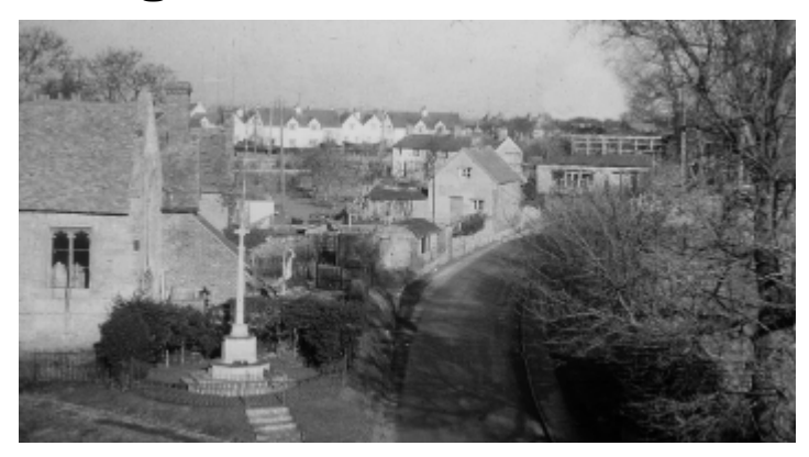
The view north from Champs Chapel to the Spar shop including the pair of cottages to be demolished soon after

John also built a large garage/ barn at the back of the shop