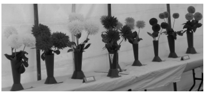
Dazzling Dahlias lined up for judging

Congratulations to all winners in the Horse and Dog shows and thank you to everyone involved in the organisation of those events.