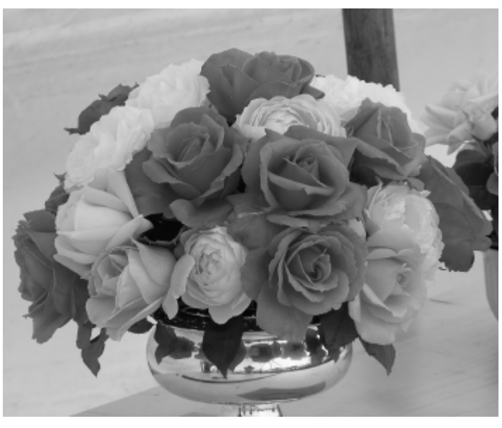
A magnifient Rose Bowl on display in the marquee

Congratulations to all winners in the Horse and Dog shows and thank you to everyone involved in the organisation of those events.