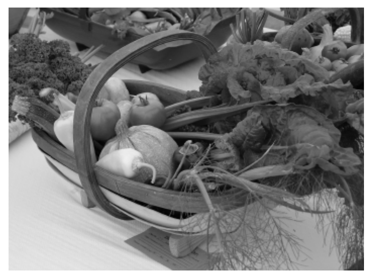
A beautiful vegetable basket