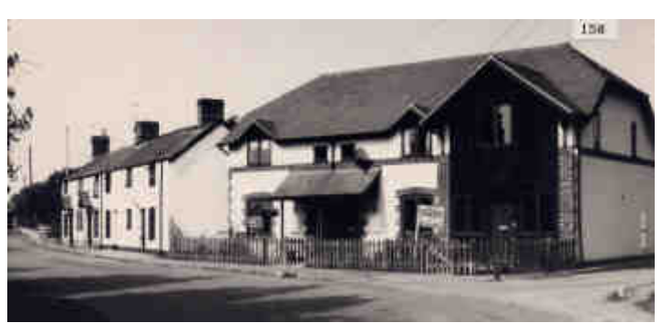
The site of the Bakery today

Ill health forced Mr Brown to make other plans and the outcome for the site was reversion to homes again. The small terrace on the White Road and two bungalows in place of the storage barn in what is now known as Old Road.