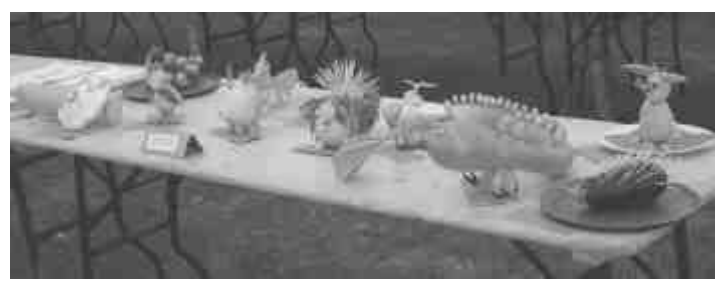
A table full of Hedgehogs!

Roast and various stalls and displays (including 455 show entries in the Exhibition marquee, Dog Agility, Austin 10s, Owls, vintage tractors, marshal arts and police vehicles).