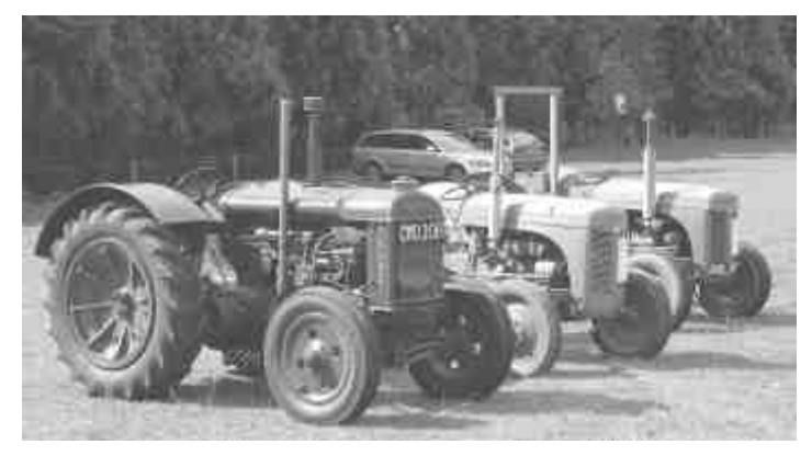
Vintage Tractors on display in the sunshine

Once the weather improved on Show day, we welcomed many visitors who were able to enjoy the Horse Show, Dog Show, Pig