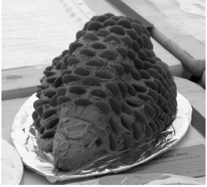
And an edible one...!

Exhibition Marquee pegged down throughout the week-end. Following the feedback received after last year's show, the