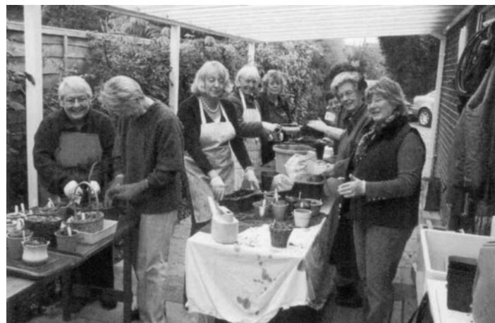
W.I. Members planting hyacinth and daffodil bulbs for sale at the Christmas Bazaar.

Extra visits are arranged throughout the year, most recently in March to the Miele headquarters in Abingdon for a fascinating cookery demonstration using their state-of-the-art kitchen equipment. We all enjoyed sampling the results, and were tempted by their new range of steam ovens (which the demonstrator predicted would replace microwaves in luxury domestic kitchens before much longer).