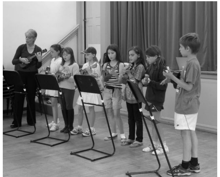
St Amands Ukulele Band

On Sunday visitors and hosts went off by coach to Longleat, to go through the Safari park, then visit the House and its many attractions- including the special