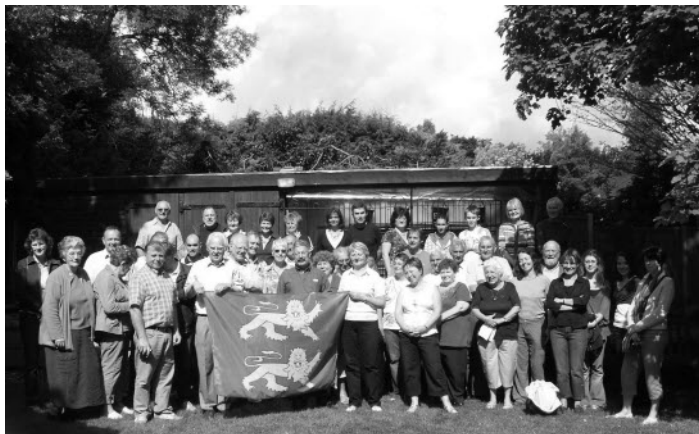
Group photograph of the 2008 exchange. Normandy flag presented by Sarceaux

opportunity of visiting Lord Bath's private apartments with their eye-catching murals and portraits, all painted by the Marquis himself.