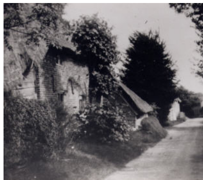
Hines Cottage, Horn Lane