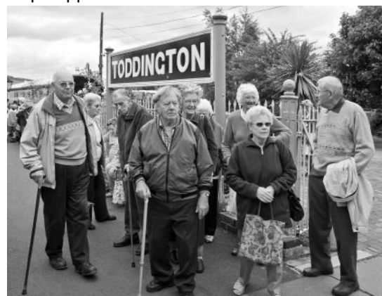
The DGA on a recent outing to Toddington

To take advantage of free meals and subsidised outings; members pay just £10 per year- it must be a bargain! For any enquiries regarding helping with or joining the DGA please contact Betty Holliday 833400