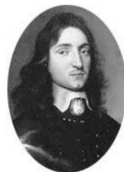
Portrait of Sir Thomas Fairfax