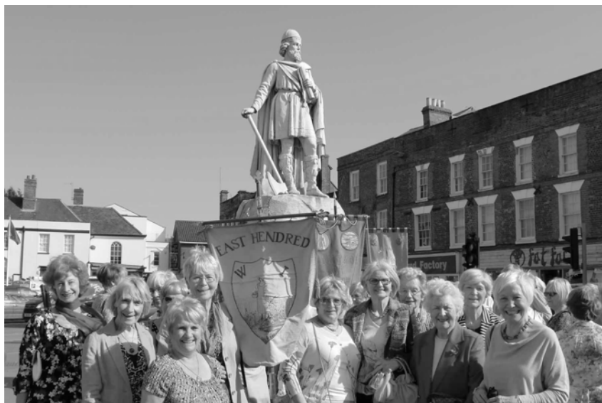
The ladies of East & West Hendred WI with their banner for the WI Baton visit in Wantage