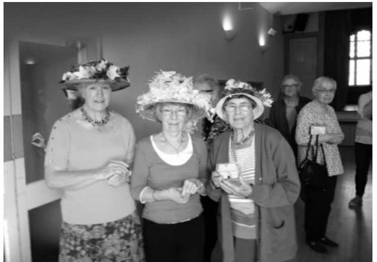
The winners of the Easter Bonnet competition