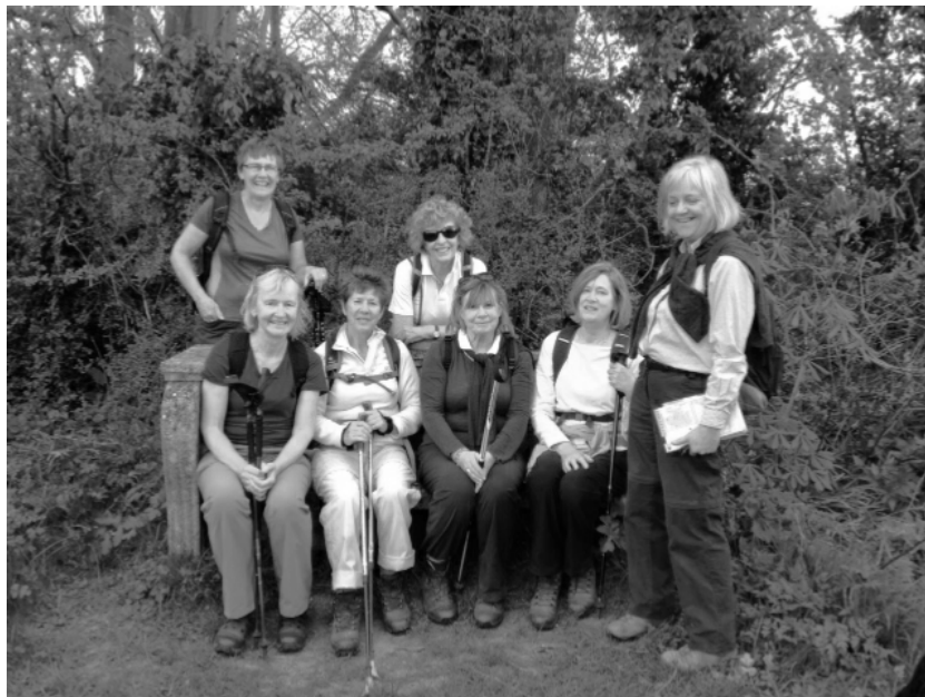
The Walking Group resting on the Darcy Dalton Way