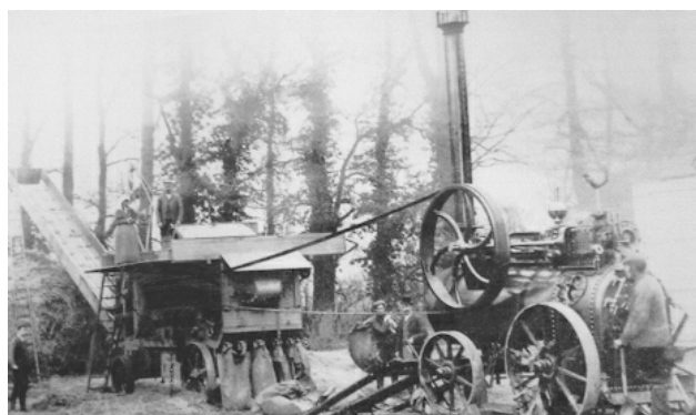
Threshing near East Hendred around 1900 (from the EHHT collection) see page 11

I was pleased to receive the reports of the impressive cycling exploits (page 13) as well as the tennis report. I would like to include information about other sporting events in the Winter Bulletin. For example, I would be happy with a sentence or two about the junior football team or any new sport you have taken up as a result of GB's Rio successes. Please email to bulletin@hendred.org