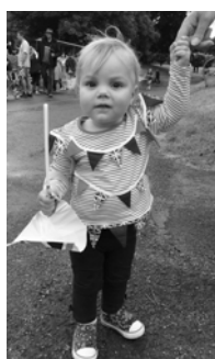
Cleo as Baby Bunting

The forecast was mixed for Sunday 12 th June so gazebos were put up along from the shop to the Eyston Arms. However the Sun came out shortly before the start. As these pictures show a good time was had by all.