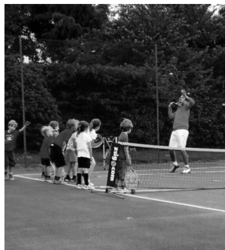
Mini-reds focus on their next move