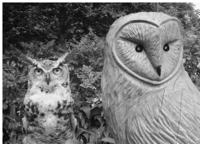
Canadian Horned Owl with Knowledge Owl

A great time was had by all and for this we would like to give our appreciation and thanks to all volunteers involved at every stage in making this day a great success and leaving a wonderful legacy for the future of the village.