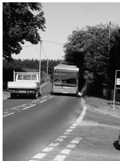
Is there room for the proposed 3m wide footway for pedestrians and cyclists on the south side of the A 417? (RH side in photo)

The Greensands application appeal will be held in Snells Hall on 29 th November to 2 nd December, when we will have a chance to put our case.