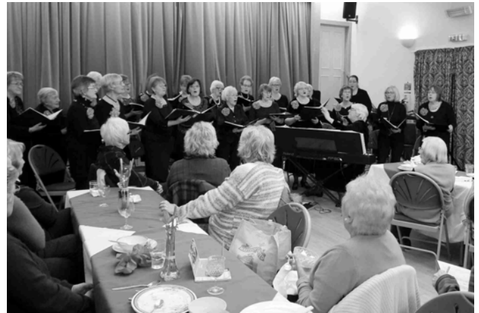
Didcot Divas in Full Song

East & West Hendred WI celebrated its 96 th birthday in January with a “pot luck” supper and entertainment was provided by the Didcot Divas, a local choir of ladies who sing in concerts in care homes and other venues to raise money for local charities. The songs and humorous monologue were very popular.