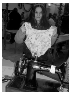
Eve with her shopping bag

A reminder that old clothes and textiles are collected for recycling if they are left in a plastic bag put on top of your green bin on recycling day. This could include the pieces cut off the T shirt.