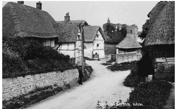
This year's exhibition at Champs Chapel will be about Newbury Road and Horn Lane. It opens on 30 th April.