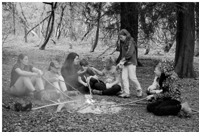
Scouts enjoying a camp fire