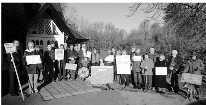
Residents showing their support at the appeal in November

Thirty people from the village attended the opening session of the appeal, reflecting the depth of feeling about this development. The PC and residents made statements at the beginning of the hearing.