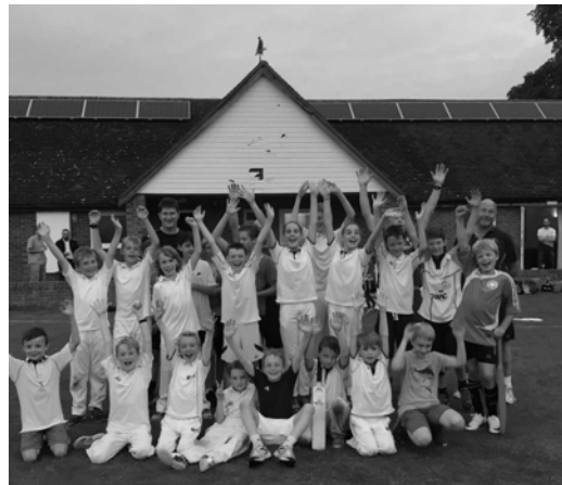
Junior Members at the Sports Ground