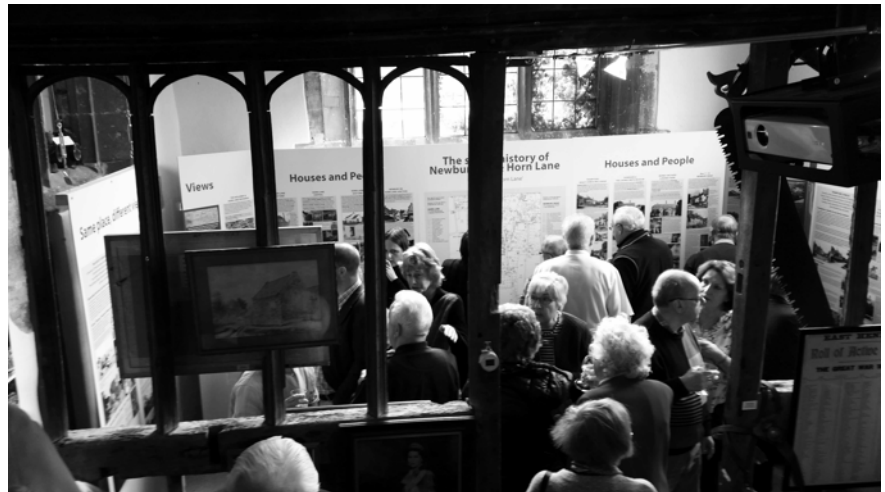
Photograph of the opening on Sunday 30 th April 2017

The village museum opened on 30 th April with its new summer 2017 exhibition entitled from 'Holloway to Horn Lane'. It is the fifth in the on-going 'Secret History of Your Street' project, and this year it focuses on Newbury Road and Horn Lane at the south end of the village.