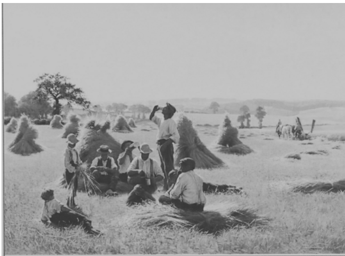
'Harvesters Resting' - oil painting by East Hendred artist T.F.M. Sheard 1898