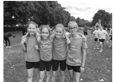
Year 5 and 6 girls