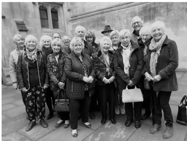
Parish Visit to Christ Church

In November we repeated last year's successful fundraising Bingo night at Snells Hall. And now we are into the Christmas season, with a Christingle service for children of all ages at 5pm on Advent Sunday (3 rd December), and a traditional country carol service of readings and music at 6:30pm on Friday 15 th December. Everyone is invited.