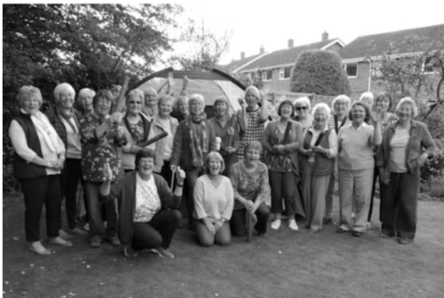
WI members enjoying an afternoon playing Aunt Sally