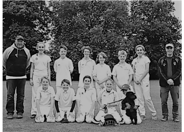
Pictured above are some of the club's junior players