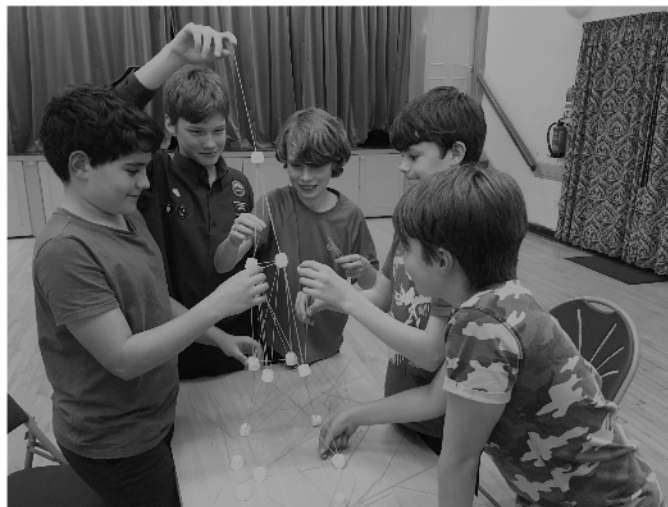
Pictured is the winning patrol with their construction of a self supporting structure that was as tall as possible from a fixed number of marshmallows and dry spaghetti.