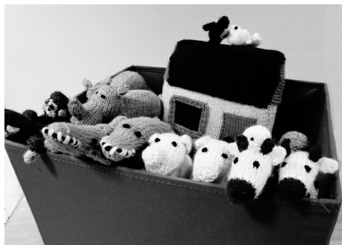
We'll be launching our knitted Noah's Ark at Easter – Sunday 1 April. There's a whole ark-full of animals, and Mr and Mrs Noah, for children to play with in church. Come and have a look. Many thanks to all our talented knitters!

Everyone is warmly invited to join us at our services and at our coffee mornings, in church on the last Wednesday of each month (that's 28 th March, 25 th April and 30 th May) from 10:30am onwards.