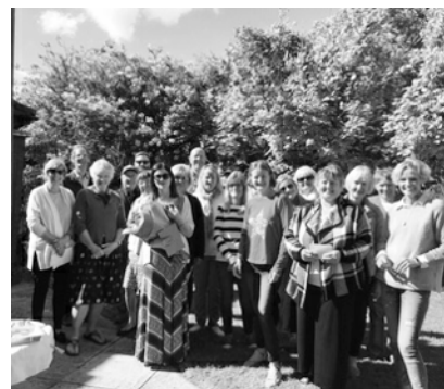
The Springline Singers (pictured above) meet every Thursday in school term time in West Hendred Village Hall