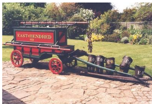
East Hendred's 1831 Fire Pump